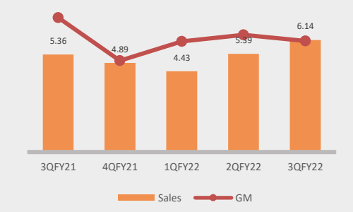
PAT (Rs'mn) vs Net Margin